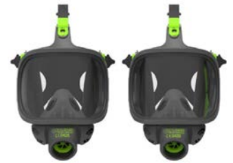
Full face masks BLS 3400 - BLS 3150 (V)