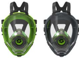
Full face masks BLS 5400 - BLS 5150