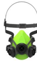
Half mask BLS SGE46